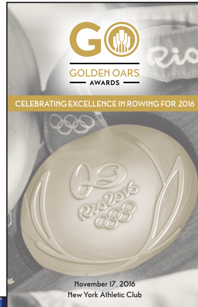
Get a closer look at all the components on the back!

When USRowing Association moved to Princeton NJ, they did not want to move the magazine and a variety of posters and invitations from the Midwest printer they had been using. After USRowing moved to the area, Harwill’s sales associate met with the management on a consistent basis. We were able to help solve minor issues on projects they were working on with their current printer. Over time we were awarded a small project. The success of that project led them to trust Harwill Express Press and we are now one of their main printing vendors. We collaborate work with their marketing and publication staff on projects. Our in-house designer works with the client to create a consistent branded look from project to project, start to finish. 🏈